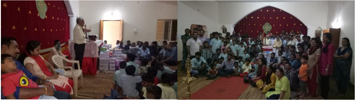
A.5.2) Lioness Club and Y's Men at Dayabhavan Home : Lioness Club (Bangalore North) members visited Dayabhavan on 17 July 2017 in celebration of Environmental Day; they planted trees in the campus as also sponsored an afternoon meal for the children.